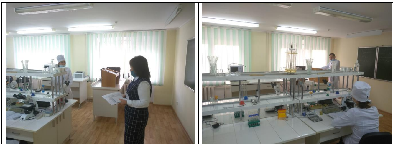
Photo 1. Visiting a practical lesson

On the part of the college staff, the presence of all persons indicated in the visit programme and according to the lists of interview sites, interviews and demonstration of practical training in accordance with the requirements of the sanitary doctor of the region in a pandemic was ensured (photo 1)